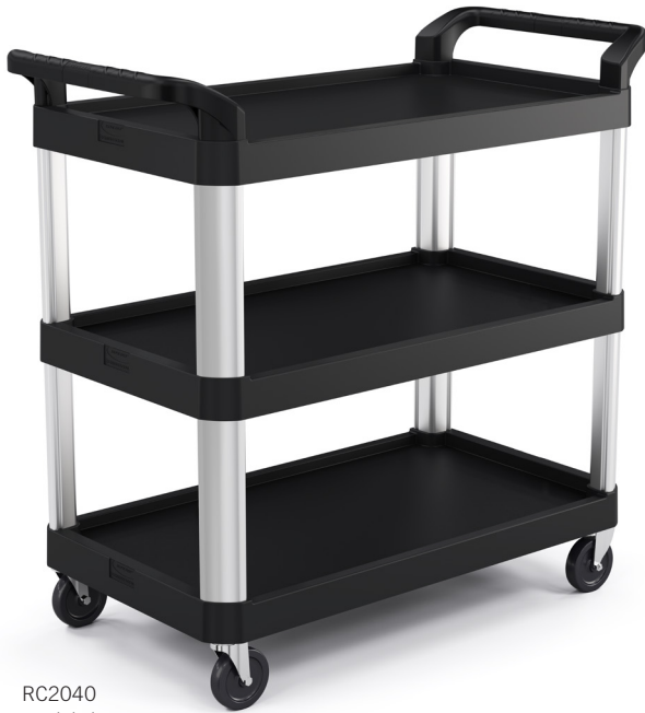
RC2040 model shown